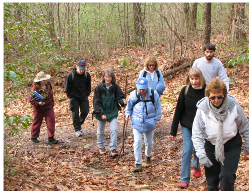
Hiking in Townsend State Forest